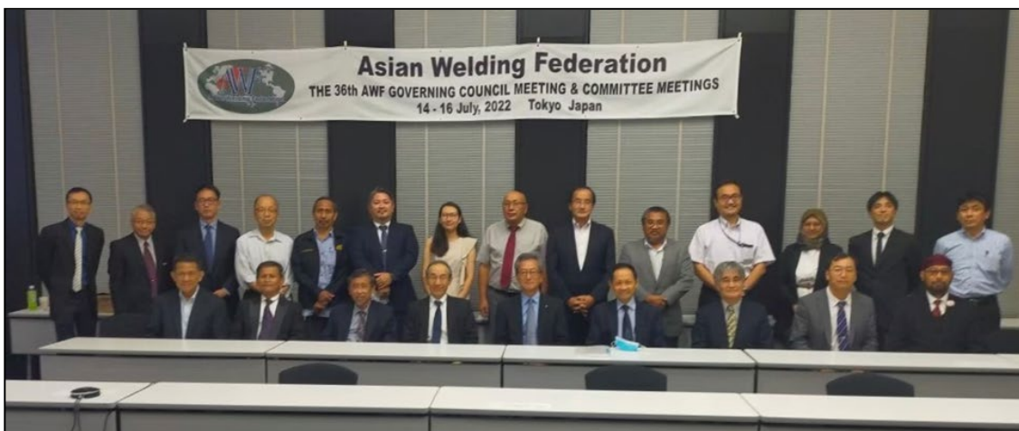
Group photo taken with APFNDT and AWF in person attendees after the session.