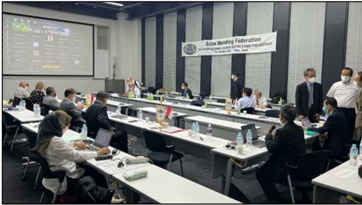
Photo taken during a break between sessions.

On July 14 th to the 16 th , 2022 the Asian Welding Federation (AWF) held its 36 th Governing Council Meeting and Committee Meetings in conjunction with the 75 th International Institute of Welding (IIW) Annual Assembly and International Conference. While the IIW International Conference was held at the Tokyo Big Sight, in Tokyo Japan, the AWF held its meetings beforehand at the Japan Welding Engineering Society (JWES) headquarters in Tokyo, Japan.