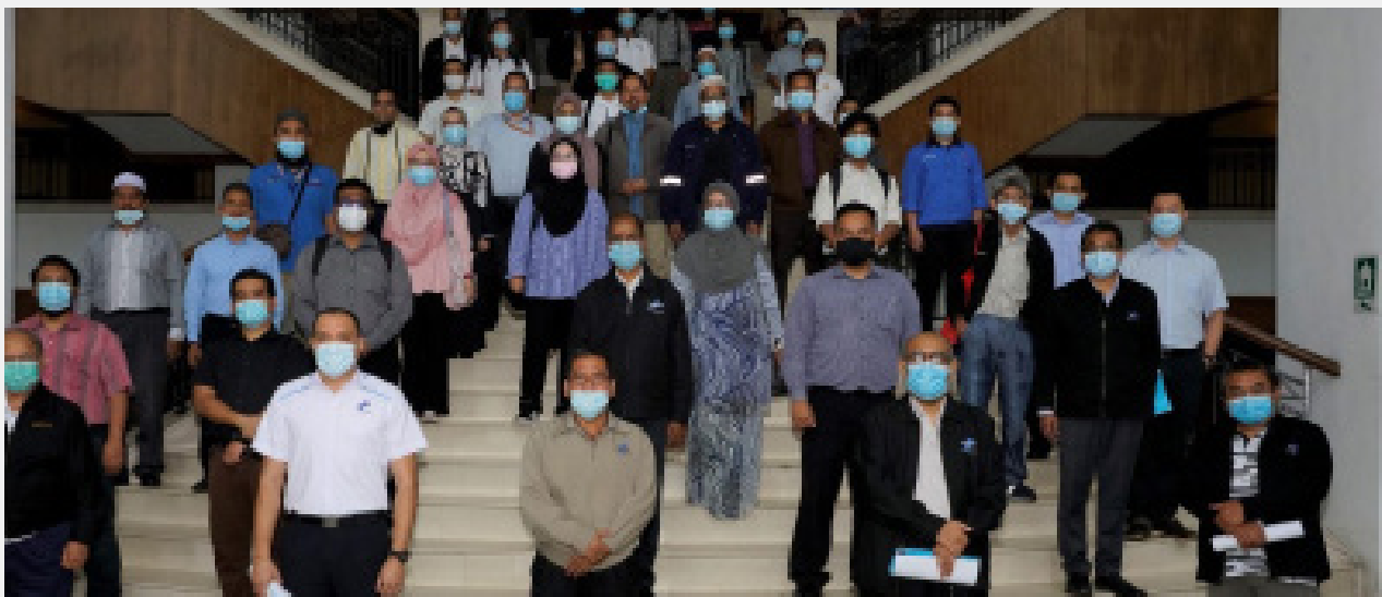
Attendees of the 31st MSNT AGM

MSNT has dutifully held the 31st Annual General Meeting (AGM) on 12 August 2020. The AGM was planned to be held on 18 April 2020 but was postponed due to Covid-19 pandemic. Over 50 members attended this meeting including the Board of Directors. During the AGM, a few issues were discussed and the Board of Directors for the term 2020-2022 were elected.