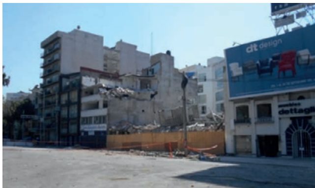
Consequences of an earthquake