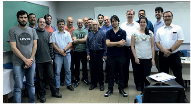
Participants of the digital radiography Level 2 course